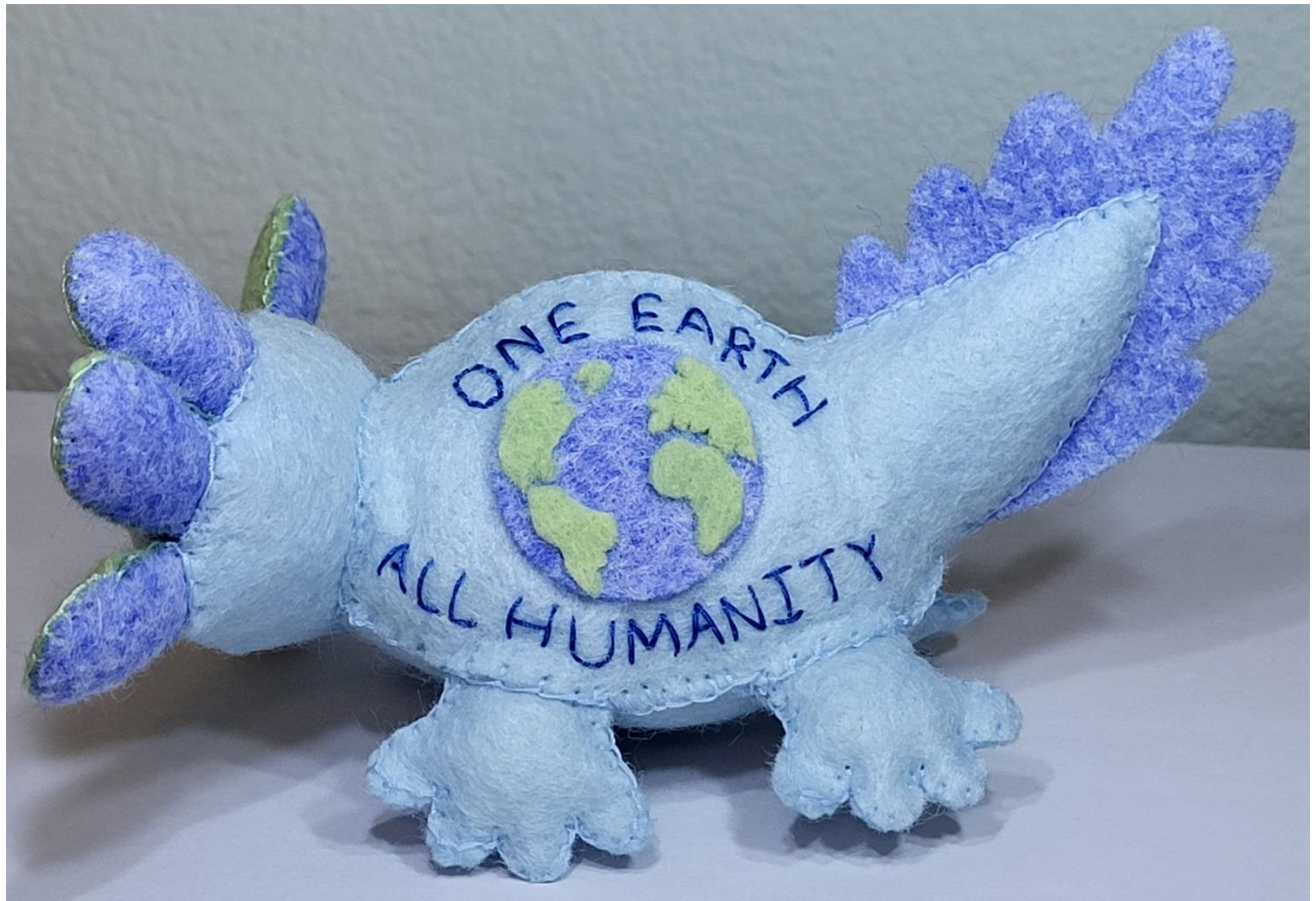
Lottie: For One Earth and All Humanity - Side View 1

Pale blue head, feet, and side of body with tail. Gills are green on the front and dark blue on the back. Dorsal crest on tail is dark blue. Earth on side of the body is dark blue and green. Blue embroidered words “One Earth, All Humanity” surrounding the Earth.