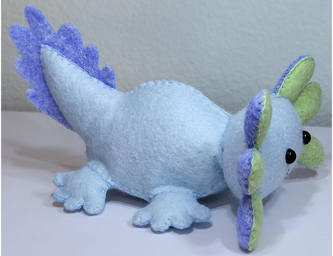
Lottie: For One Earth and All Humanity - Side View 2

Pale blue face, head, feet, and side of body with tail. Gills are green on the front and dark blue on the back. Dorsal crest on tail is dark blue. Black eyes on face.