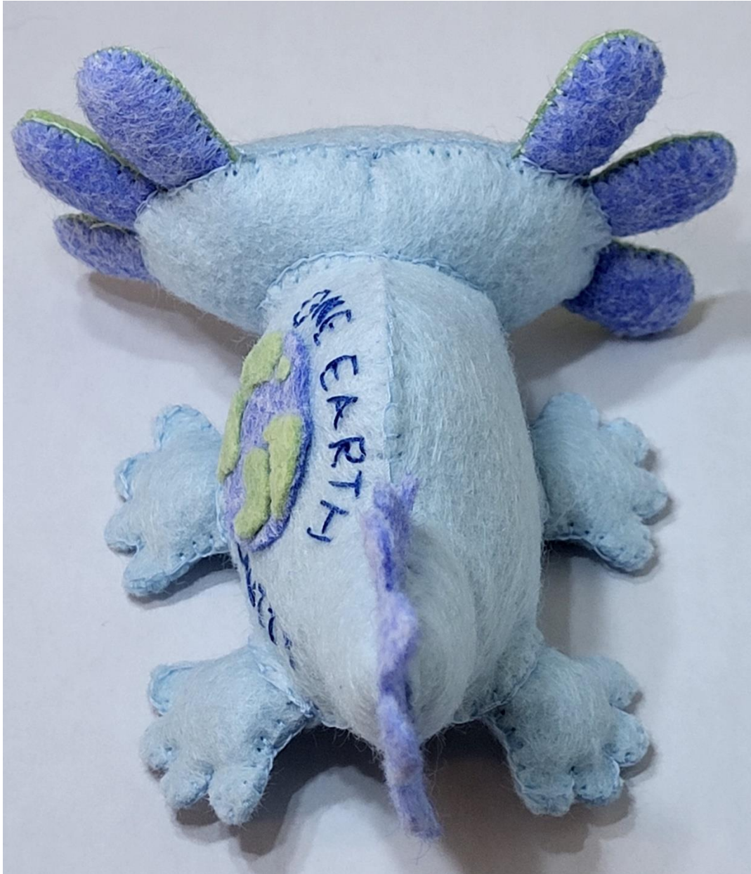
Lottie: For One Earth and All Humanity – Back View

Pale blue head, feet, and sides of body with tail. Gills are green on the front and dark blue on the back. Dorsal crest on tail is dark blue. Earth on side of the body is dark blue and green. Blue embroidered words “One Earth, All Humanity” surrounding the Earth.